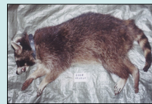
Fig. 4: Anesthetized female raccoon 2008 with a 90g VHF radio collar. Kassel July 2001.