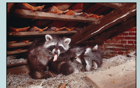
Fig. 9: The most frequent places for the radio collared raccoons were the lofts in inhabited houses which provide best conditions especially in winter.