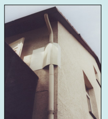
Fig. 11: Effective method to prevent the raccoon from getting into the inhabited house.

Through education and directed measures it is also possible with relatively few resources to minimise the existing conflict potential. The most important criteria for this are intensive public relations work and information strategies.