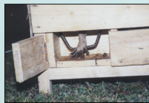
Fig. 3: The mechanism to close the trap is in a separate food box and makes it possible to capture only raccoons (mis-capturing rate = 1.6 %).