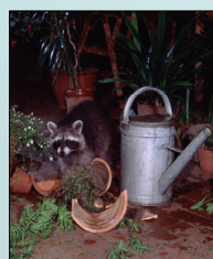
Fig. 10: Often people consider the raccoon in the urban habitat to be a nuisance.

In the sensitive area of zoonoses it has been shown that with clear and objective information on the dangers and risks (particularly on Baylisascaris procyonis ) the existing problems and fears can be effectively removed.