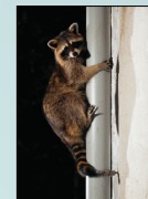
Fig. 8: The best way to climb the building is the pipe of the rain channel.