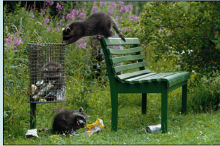
Fig. 1: Our today's affluent society produces a huge food abundance in the urban habitat which is a great supply of energy for the raccoons and so this is the reason for the partly high density of raccoons.

Due to its high ecological plasticity, its ability to climb and its tactile skills, the raccoon has had particular success in claiming human settlement areas for itself. This is notably applicable in Central Europe for the north Hessian city Kassel, in which raccoon densities of ca. 100 animals per 100 ha were established in places (Gunesch 2003). A marked increase in conflicts with the population of Kassel led to a research project in 2001/02 on the urbanization of the raccoon being conducted (Michler 2004).