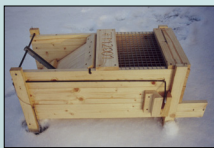
Fig. 2: Wooden trap (75x30x35 cm) for capturing raccoons.

All in all 106 different raccoons over an area of 300 ha were caught in the city area of Kassel. From these animals 17 adult raccoons (9 females, 8 males) were immobilized with the aid of a ketamine-xylazine anaesthetic agent and fitted with a 90 g VHF radio collars (corresponding to ca. 1.5 % of average body weight). The telemetric data collection took place between July 2001 and March 2002 over an area of ca. 2200 ha both in the western parts of Kassel city and the bordering Habichtswald. After the data evaluation of 2785 localisations (1674 night and 1111 day localisations), statements could be made concerning the home range, the day resting site and the social system under the particular circumstances of an urban habitat (Michler 2003).