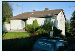
Fig. 7: Typical building den site in Kassel. The left chimney served a female raccoon as den site throughout the winter.